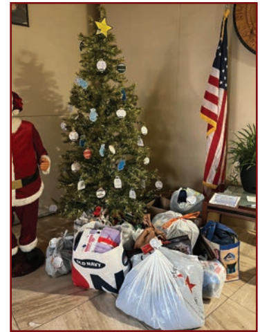
Holiday Giving Tree

The MAS school family of two children and their mother was provided with stuffed stockings, $300 worth of toys, a $100 gift card to a favorite